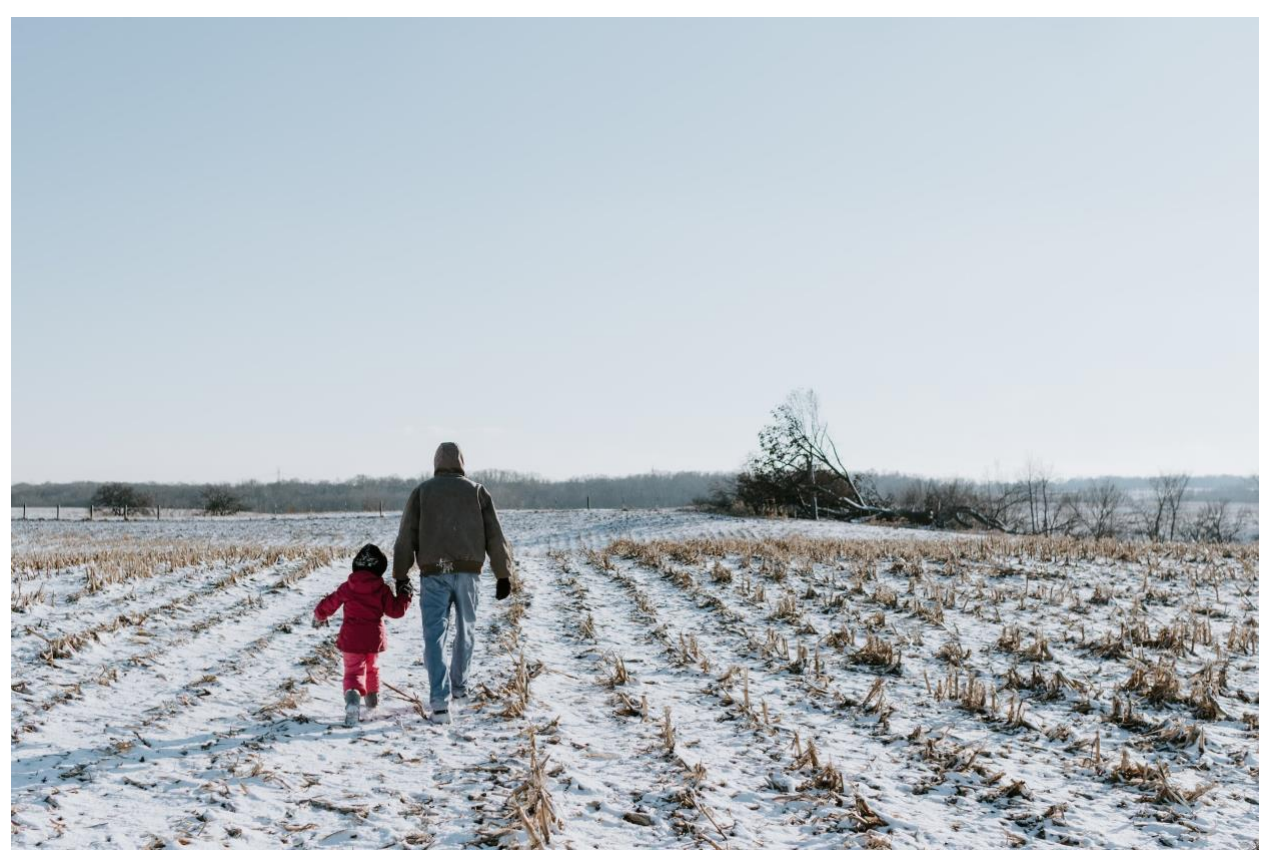
Give Them Residence Within You.

Is it true that quality is better than quantity in terms of time with our kids? Some say that the parent-child bond is a result of "quality time," which is not determined by the amount of time a parent and child spend together, but rather by what they do during this time. While this quality time does have an important effect and is a form of being present for our children, I believe that deeper bonds are formed and maintained due to the amount of incidental time we spend with our children.